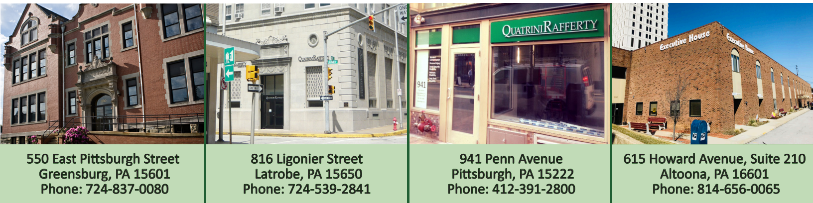
550 East Pittsburgh Street Greensburg, PA 15601 Phone: 724-837-0080

A publication provided for the friends and clients of QR